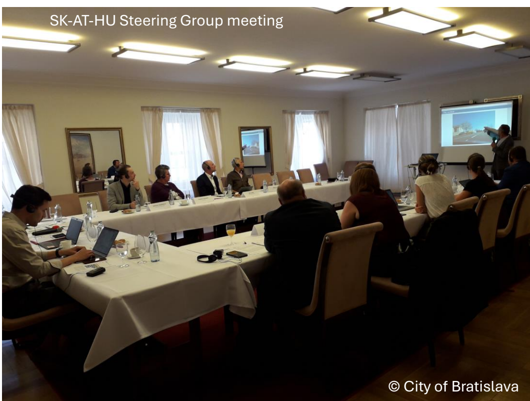
SK-AT-HU Steering Group meeting